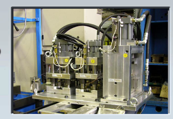
Detail of dies