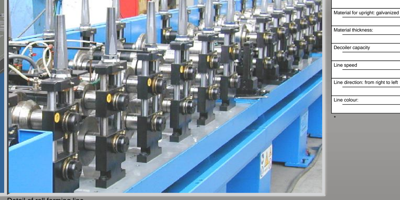
Detail of roll forming line