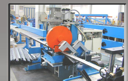
Flying saw and unloading bench