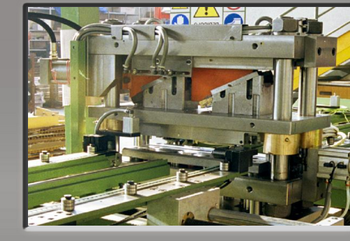
Detail bending unit