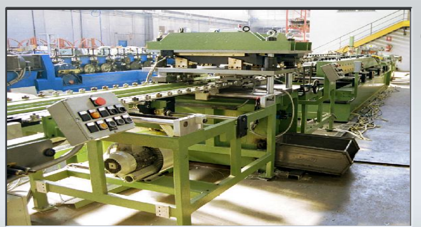
View of the line