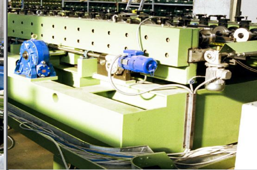
Detail roll forming line